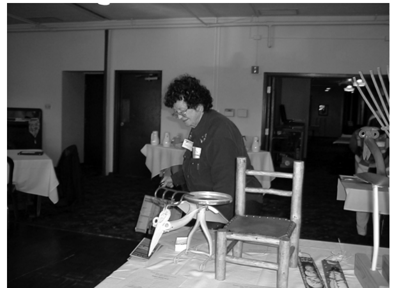
2003 Annual Meeting, Historic Sheridan Inn

Powder River’s Auction has become a favorite of members and guests alike. Join us over drinks, snacks, and conversation for a relaxing, enjoyable time with friends from throughout the Powder River network— and put in a bid to support our efforts across the Basin.